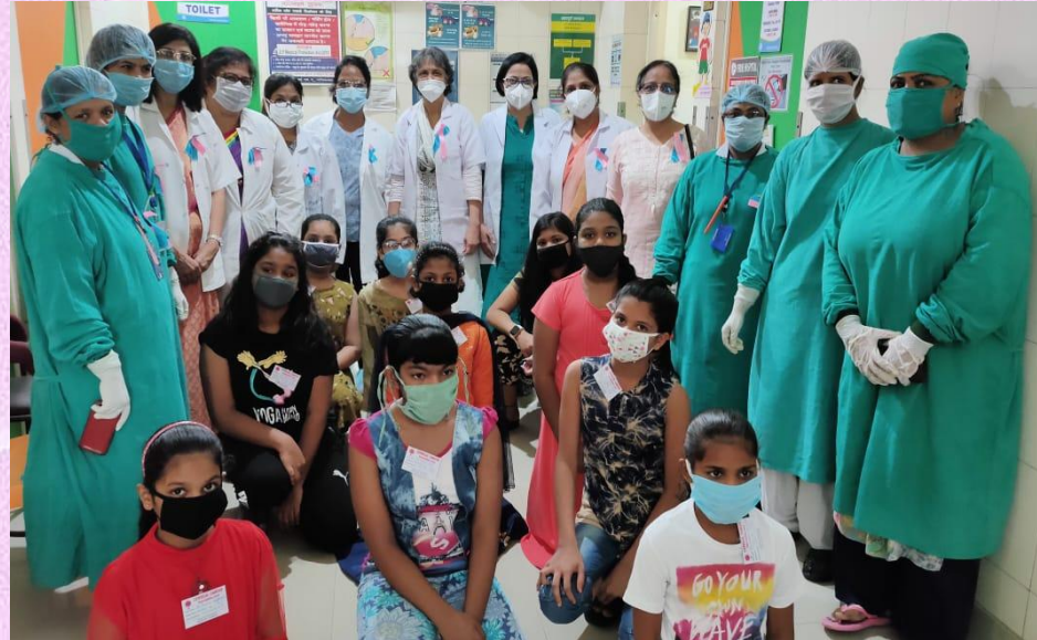
Vaccination of girls on 16th of Aug 2020