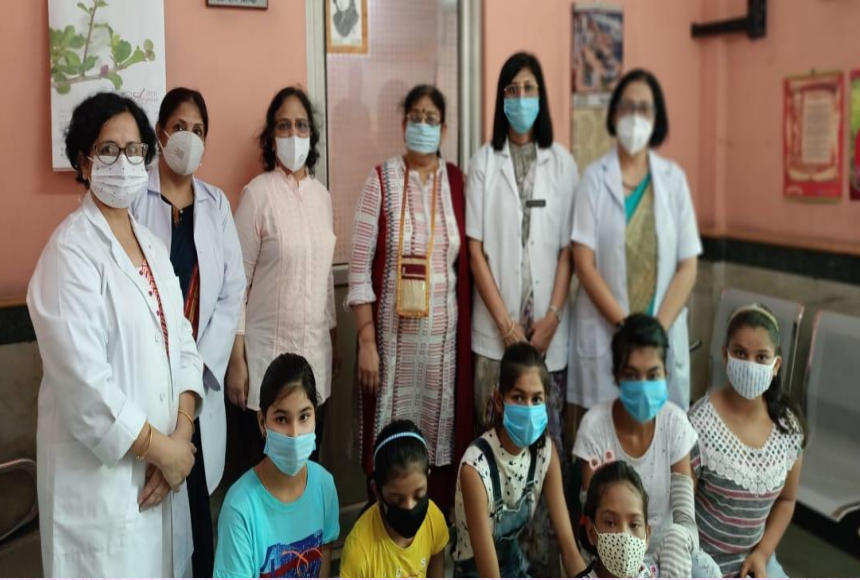
Vaccination of girls on 9th of Aug 2020